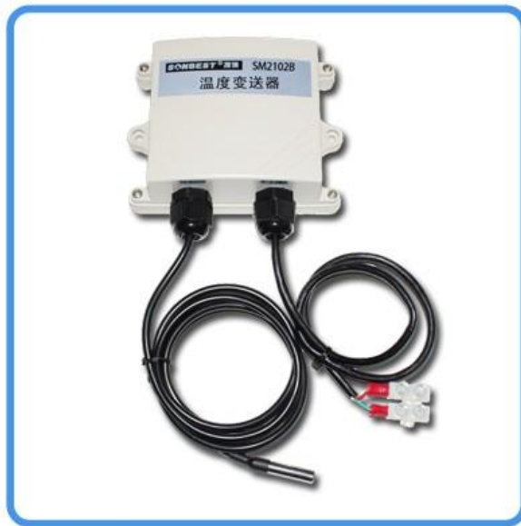
RS485 protection type PT1000 temperature sensor