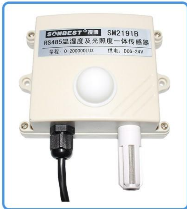
RS485 interface illuminance and temperature and humidity integrated sensor (without power supply)