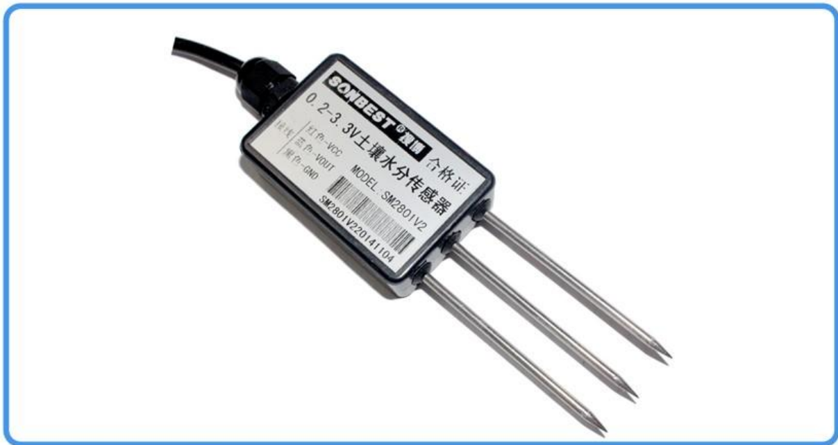
SM2801V2 soil moisture sensor (Shipped as optional) (without power supply)