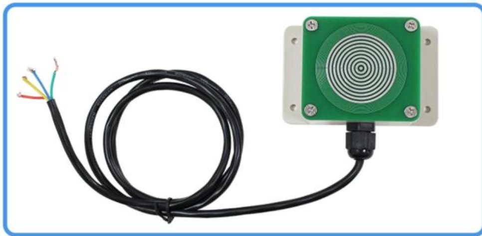
Rain and snow transmitters