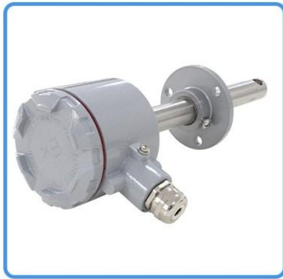
High temperature duct wind speed sensor