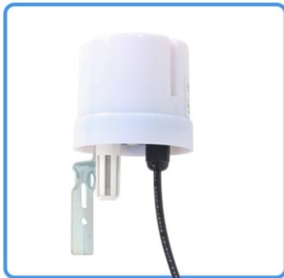
Outdoor sensor (excluding power supply and converter)