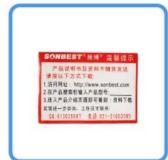
Warm reminder card