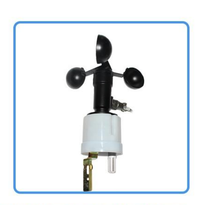
Outdoor light temperature and humidity sensor (Power supply not included, converter not included)