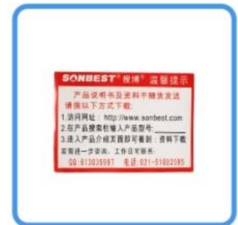
Warm reminder card