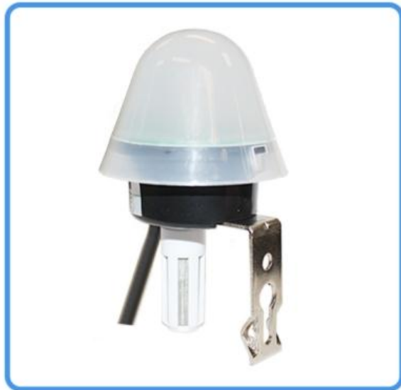
Outdoor sensor (excluding power supply and converter)