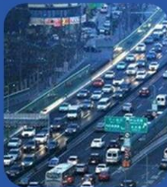
NO.5 City roads