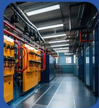
NO.6 Fire water tank