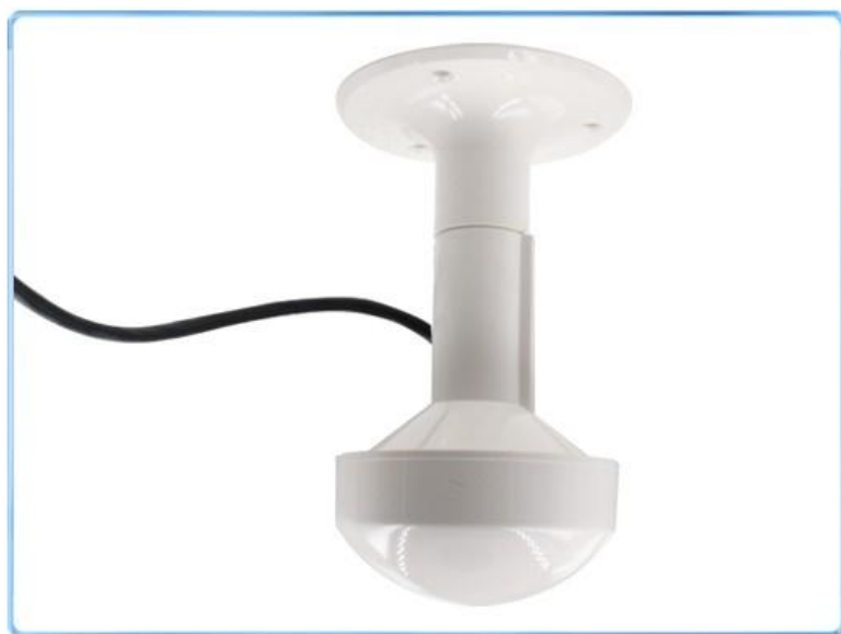
1 radar sensor (The actual delivery is subject to the user's selection)