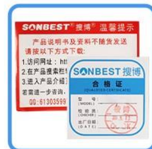
Warm reminder card Certificate of conformity