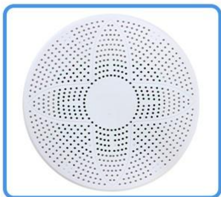
Ceiling type multi-parameter sensor (No converter and power supply) (Delivered according to user options)