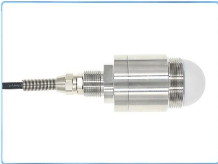
1 radar sensor (The actual delivery is subject to the user's selection)