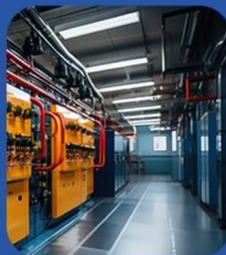
NO.6 Fire water tank