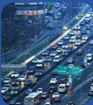
NO.5 City roads