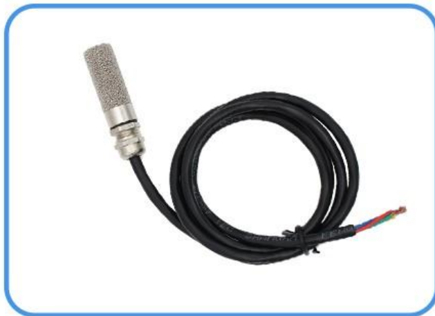
Temperature and humidity sensor