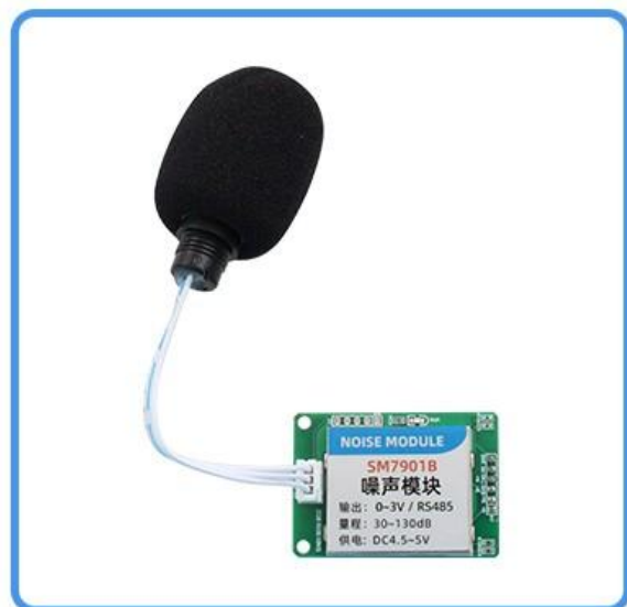
CURRENT TYPE NOISE MODULE