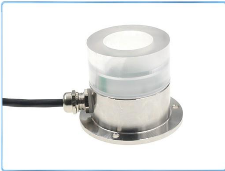
1 turbidity detector (The actual delivery is subject to the user's selection)