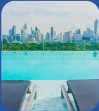
NO.4 swimming pool