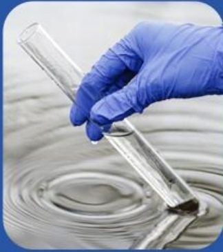
NO.1 water treatment

Test tube turbidity detectors are widely used in water treatment, rivers and lakes, industrial fermentation, swimming pools, aquaculture, hydroponic industry and other environments