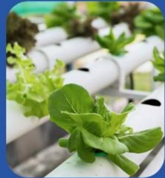
NO.6 Hydroponic industry