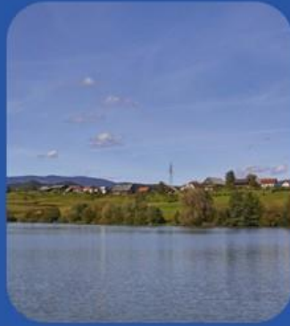
NO.2 Rivers and lakes