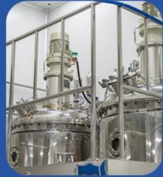
NO.3 Industrial fermentation