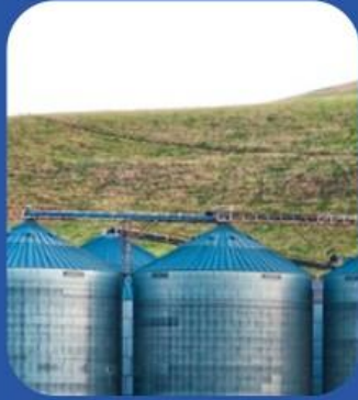
NO.1 Container level monitoring

Ultrasonic sensors are suitable for precise industries such as container level monitoring, silos, and self-fire water tanks, and can also accurately detect objects in the face of harsh environments and complex work