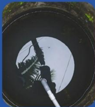
NO.5 Sewage treatment