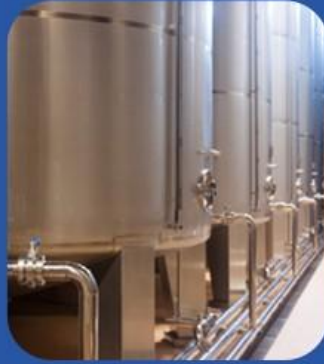
NO.2 Beer kegs