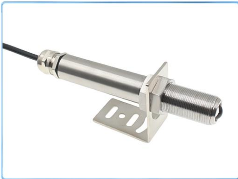
Directional flame detection sensor (The actual delivery is subject to the user's selection)