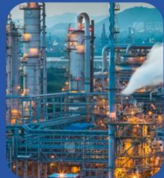
NO.6 Production workshop