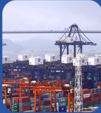
NO.2 Engineering Architecture