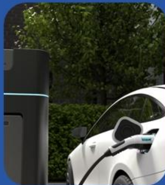
NO.5 Charging piles