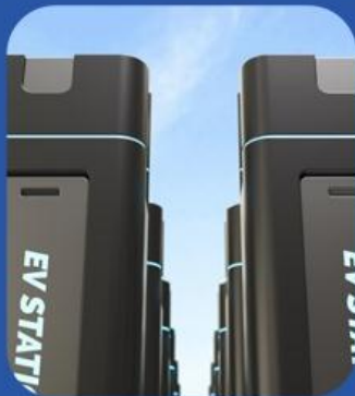
NO.4 Oil storage stations