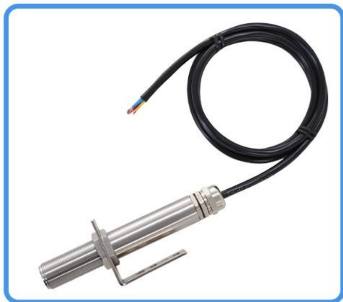
Stainless steel audio frequency sensor (No power supply, no converter)