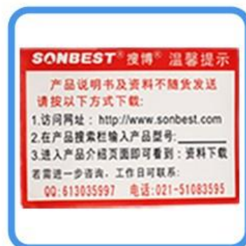
Warm reminder card