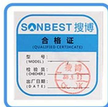
Certificate of conformity