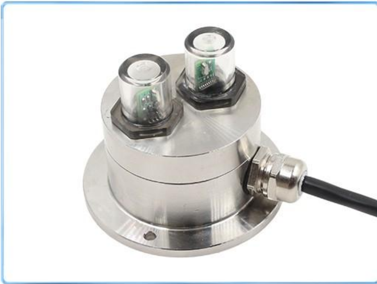
1 turbidity sensor (The actual delivery is subject to the user's selection)