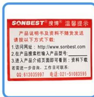
Warm reminder card