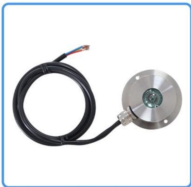
Stainless steel illuminance sensor (No power supply and no converter)