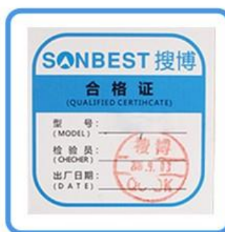
Certificate of conformity