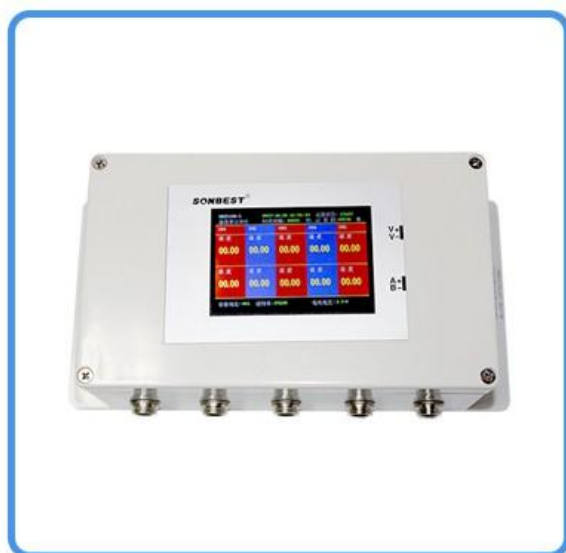
5-channel temperature and humidity recorder