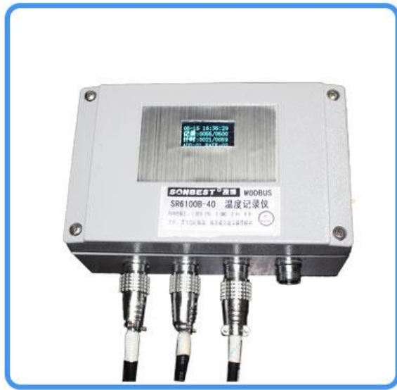
Recorder (charger included)