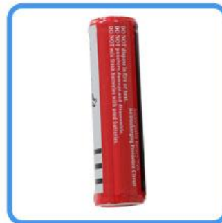
18650 lithium battery