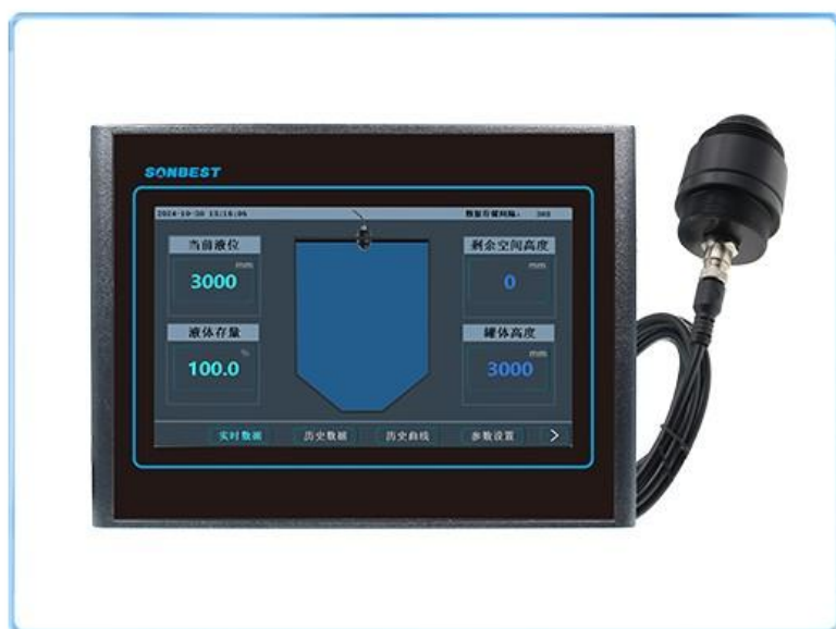
Sensor + touch screen (The actual delivery is subject to the user's selection)