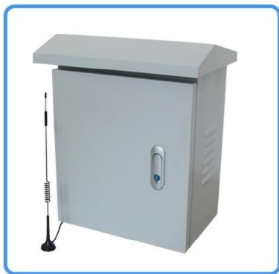
Wireless data acquisition instrument