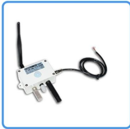
CO 2 , ILLUMINATION, TEMPERATURE, HUMIDITY, ATMOSPHERIC PRESSURE INTEGRATED SENSOR (ACCORDING T O THE USER WITH SHIPPING)