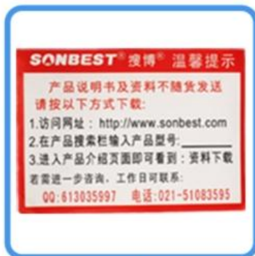
Warm Reminder card