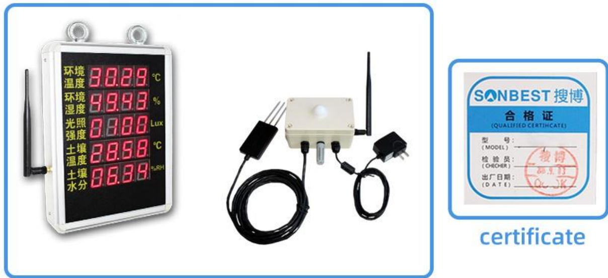
1 set instrument