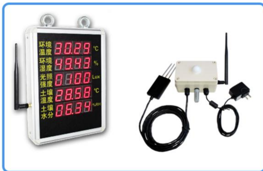
1 set instrument