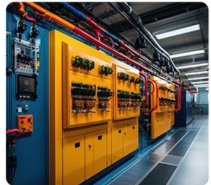
Fire water tank