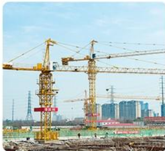
Tower crane work