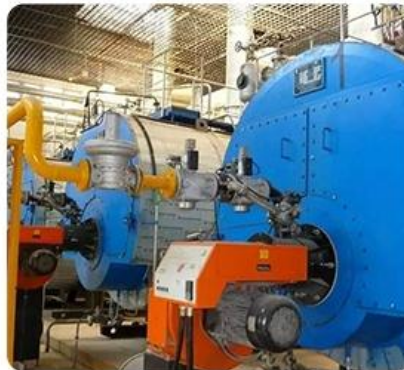
Closed storage tanks