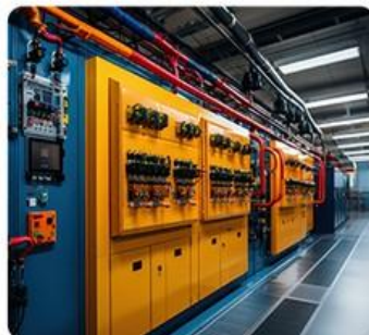
Fire water tank