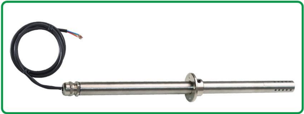
Stainless steel humidity and temperature transmitter