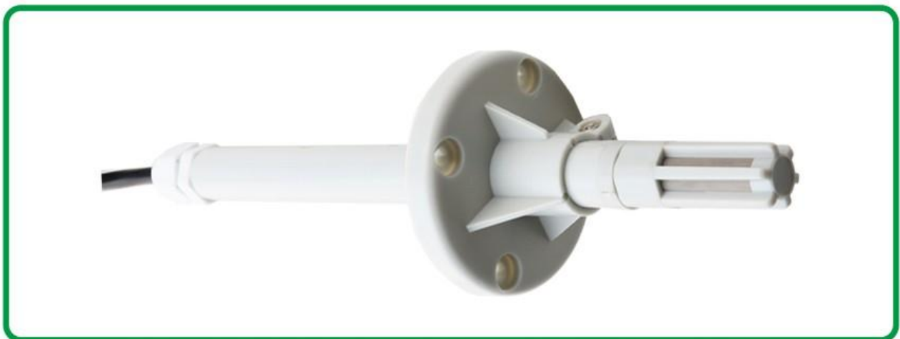
Plastic humidity and temperature transmitter