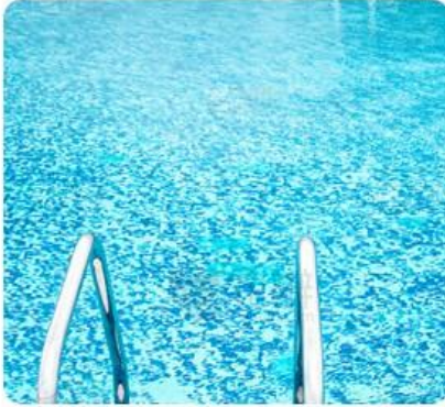
Water quality testing

Turbidity sensors can be widely used in water quality testing, food testing, washing machines, scientific research, aquaculture, laboratories, chemical and other environments.