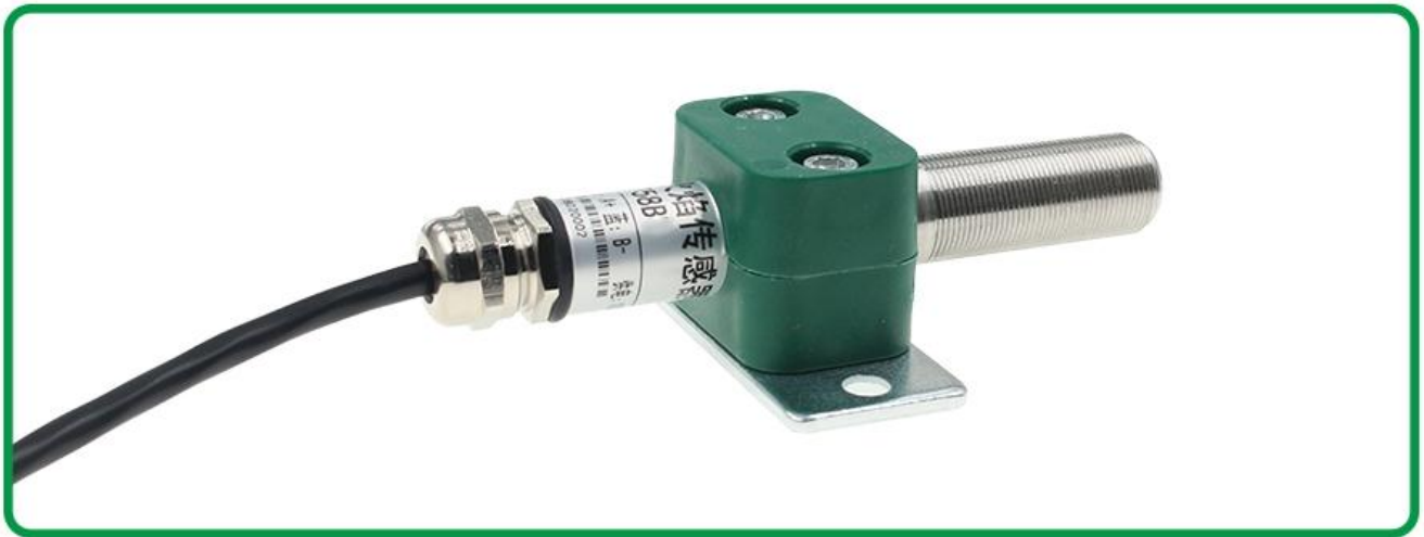
Flame Sensor: Quantity: 1 pcs