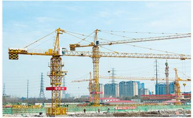
Tower crane site