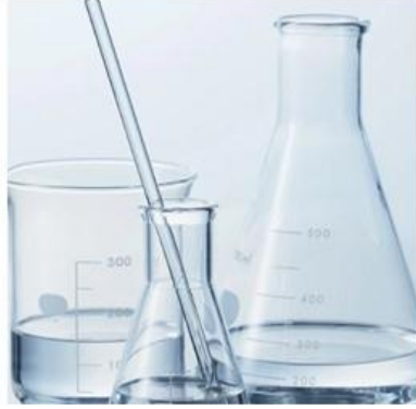
Academy of Sciences