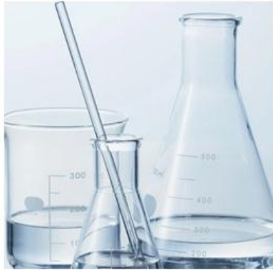
Academy of Sciences