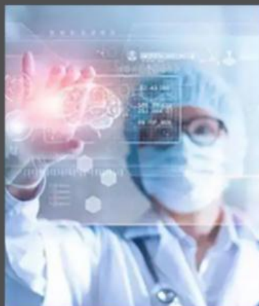
Medical and Health Monitoring