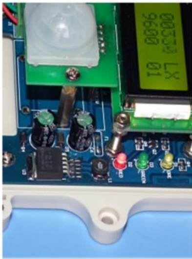
User circuit board