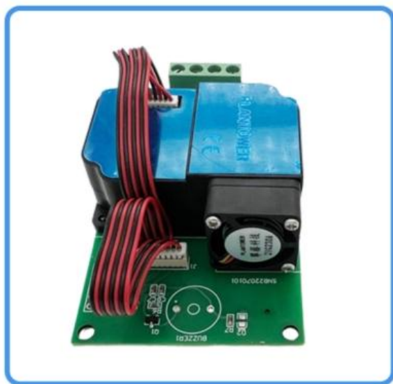
carbon dioxide sensor