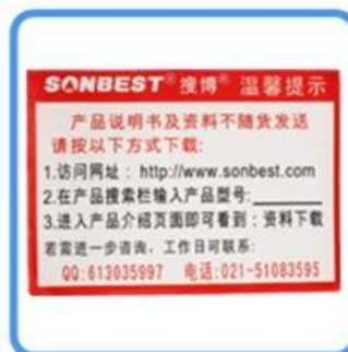
Warm reminder card