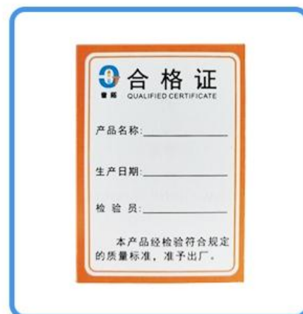
certificate of conformity

Number of bendable flame sensors: 1 (Actual shipment subject to user selection)