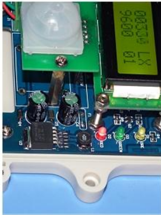
User circuit board