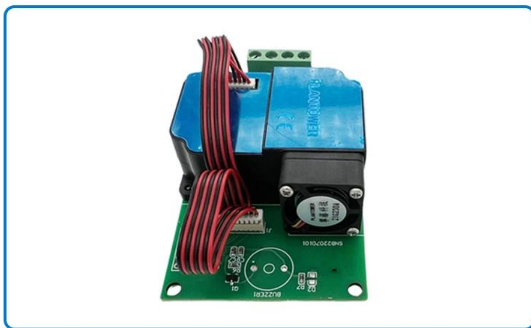
Laser dust sensor